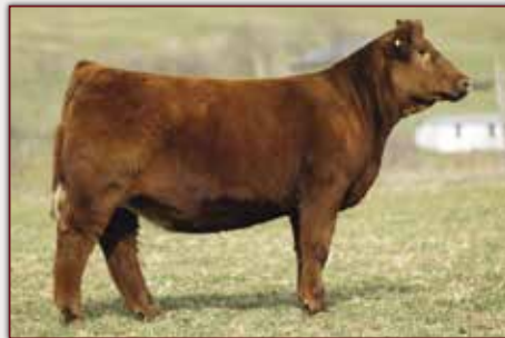
Maternal Sib to Lot 53 Embryos