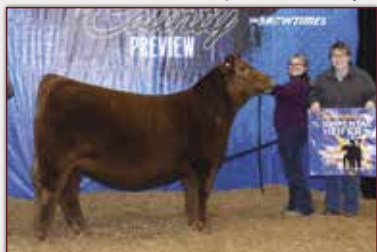
JSUL Extra Glamourous 2308K Lot 54 Donor