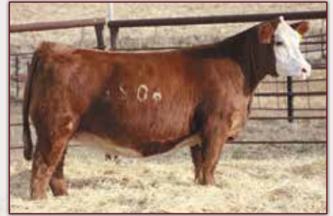
W/C Miss Werning 6026D Dam of Lots 70 and 71