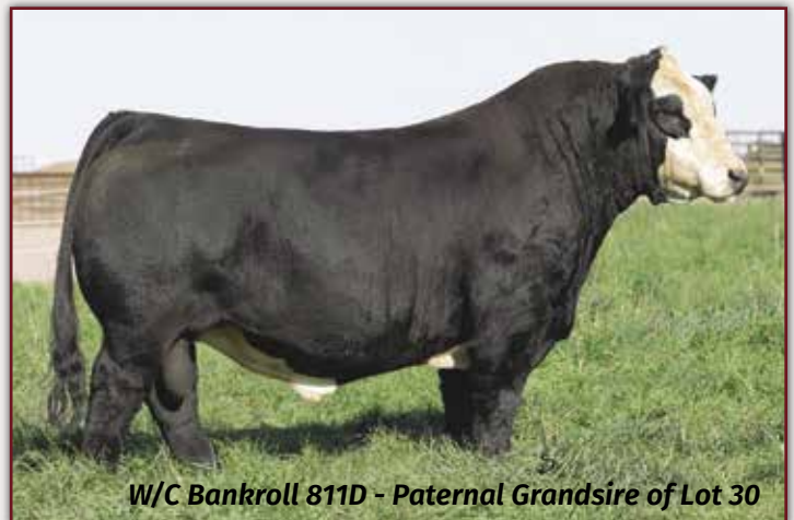
W/C Bankroll 811D - Paternal Grandsire of Lot 30

W/C BANKROLL 811D sire ROWE BANKROLL 17D MAG PRIDE 17D MR HOC BROKER dam ROWE MS 30A 30X