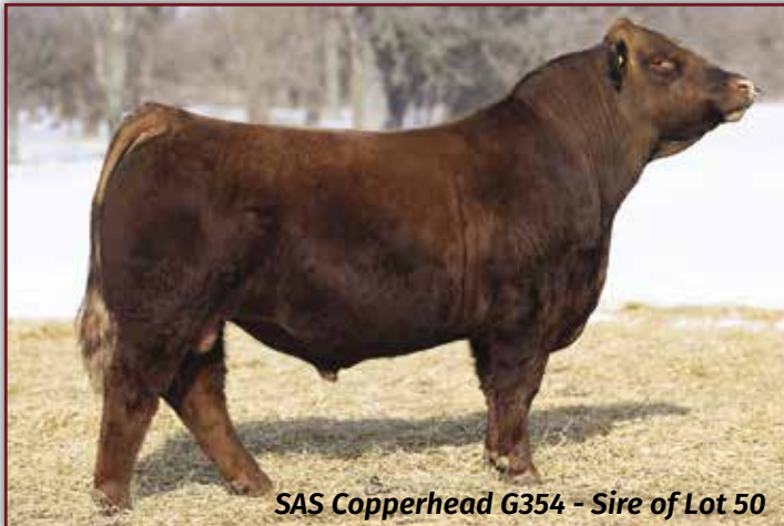
SAS Copperhead G354 - Sire of Lot 50

LOCLN Paisley is a red spot faced fall heifer. She is out of Copperhead and a STF Desa Rae granddaughter. She will make a nice show heifer prospect and then a very nice cow. Will have a video closer to sale day.