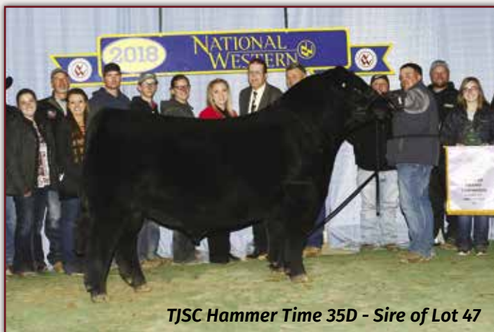
TJSC Hammer Time 35D - Sire of Lot 47

MR TR HAMMER 308A ET sire TJSC HAMMER TIME 35D TJSC SO SWEET 104X HTP SVF IN DEW TIME dam MELBYS SHAY MELBYS VICTORIA