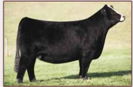
JS Pearl 37F - Dam of Lots 6A and 6B