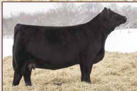
CAJS Sweet Emotion 42Z Dam of Lot 1