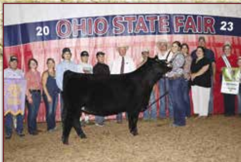
FSCI Ms Emotion K713 Reserve Champion Simmental Female 2023 Ohio State Fair Open Show