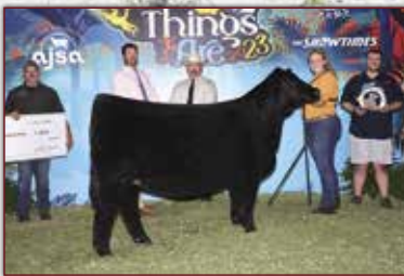
Maternal Sister to Lots 6A and 6B