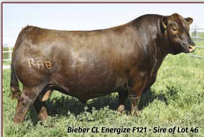
Bieber CL Energize F121 - Sire of Lot 46

BIEBER CL ATOMIC C218 sire BIEBER CL ENERGIZE F121 BIEBER CL ADELLE 575D JF AMERICAN PRIDE 0987X dam RSTR TIFFANYS PRIDE JF MADISON 1030Y