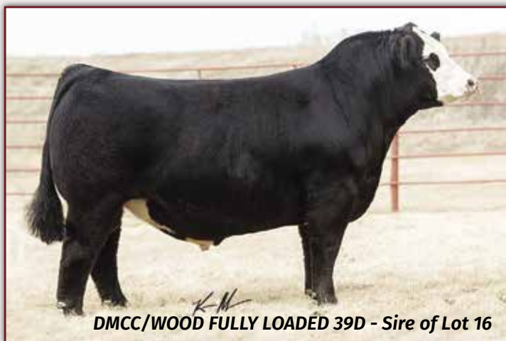
DMCC/WOOD FULLY LOADED 39D - Sire of Lot 16