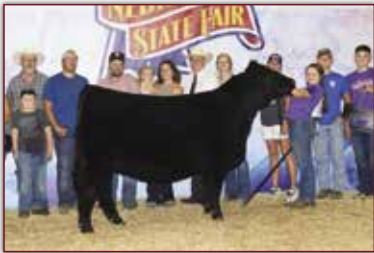
Maternal Sister to Lots 6A and 6B