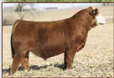
W/C Red Bird 269J Sire of Lot 54 Embryos