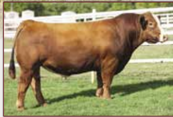
SWC Red Wave 376J - Sire of Lots 37 and 38