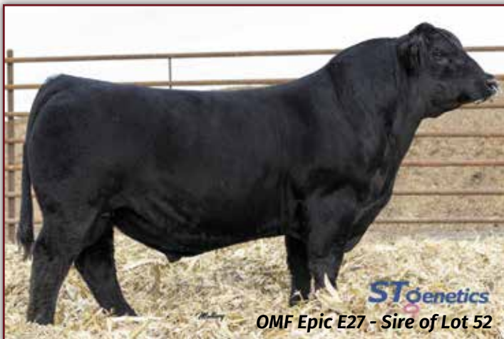
OMF Epic E27 - Sire of Lot 52