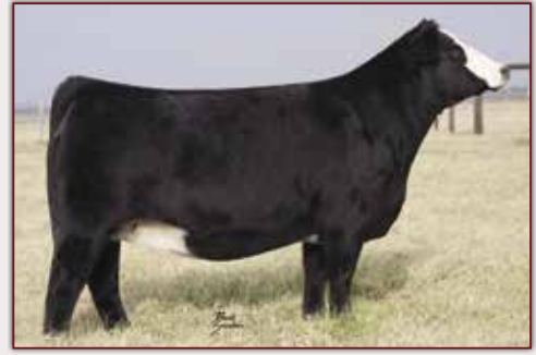
K-LER/RC Miss Hoya Saxa Dam of Lots 2A, 2B and 3