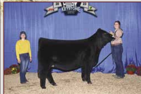
FSCI Ms Emotion K713 Champion Division 4 Female 2023 KILE Junior and Open Shows

MISSING RAIL SIMMENTALS/WEST POINT CATTLE