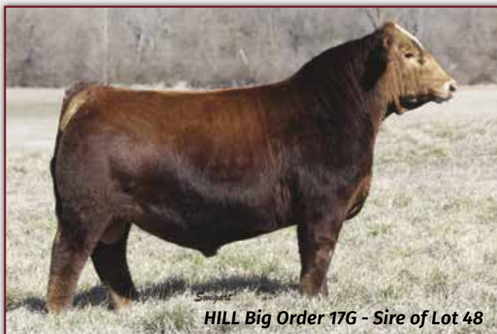
HILL Big Order 17G - Sire of Lot 48

W/C EXECUTIVE ORDER 8543B sire HILL BIG ORDER 17G HPF LOVE ME D011 LEACHMAN CADILLAC L025A dam RSTR SCARLET 105E R STAR CHARLOTTE 1151