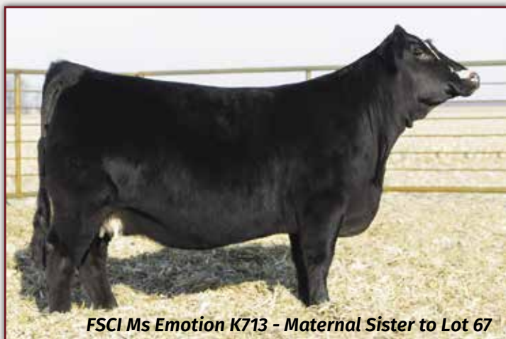
FSCI Ms Emotion K713 - Maternal Sister to Lot 67

67A: Heifer calf, M16, at side by OMF Epic E27 (ASA# 3317371) born 1/26/2024. FSCI Ms Emotion K16 has one of the most impressive pedigrees in the Simmental world. There are not too many scenarios where a mating can be replicated but the proof is in the pudding. Her full siblings have dominated in the show ring and one sister commanded a $90,000 valuation at public auction. Her brothers were members of the Champion Purebred Pen of 3 bulls at the National Western in 2017 and are now top AI sires. SFI Brigade D21 for Holtkamp Cattle Co and SFI Savage D20 for Bruhn Farms, between these two bulls there are over 500 registered Simmental progeny. She has a fancy heifer calf at side sired by OMF Epic E27 that already has the look.